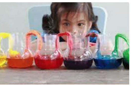
Fine motor skills Cognition and Learning