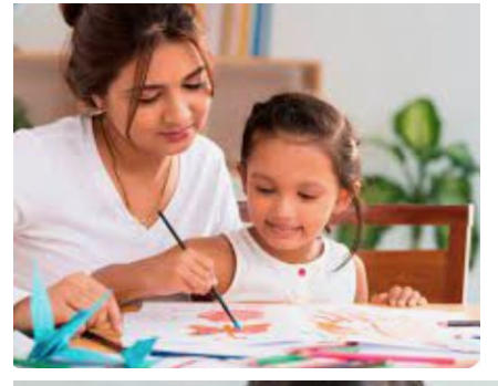
Fine motor skills Cognition and Learning