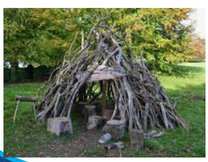
Fine and Gross Motor skills, communication skills,